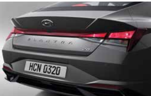
Bulb Rear Combination Lamp