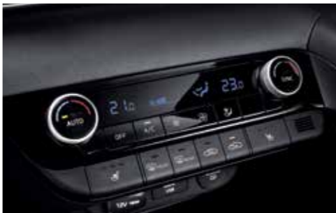
Dual Full Auto Air Conditioner