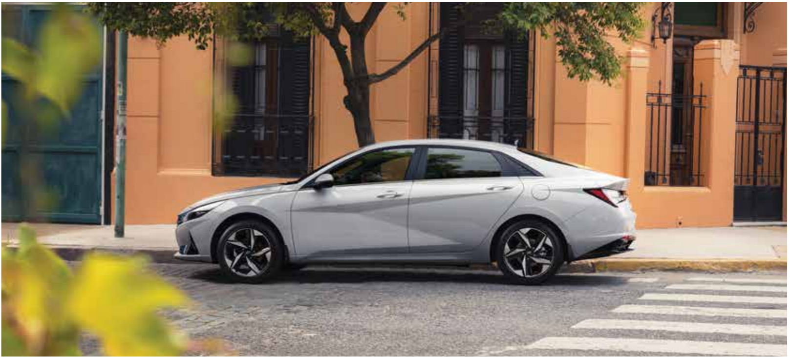
Parametric Jewel Surface Three sections emerge out of three bold-edged lines intersecting at a single point, creating three different colors of light.

The 'Parametric Dynamics' design accentuates geometric aesthetics of the elongated hood and sleek roof lines, completing the visionary and innovative style.