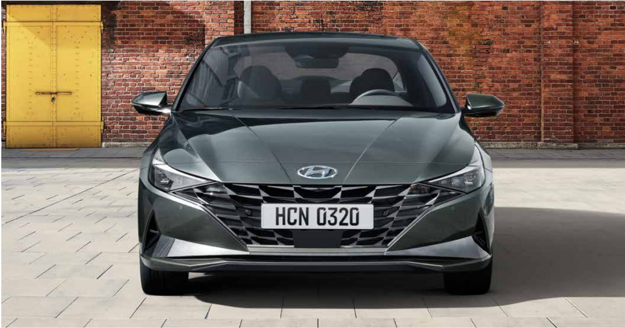
Parametric Jewel Pattern Grille

The stereoscopic Parametric Jewel-pattern design highlights the depth of the front grille, making it resemble diamond-cut gemstones, and the bold and elongated front headlights come together to give Elantra its front sporty look.