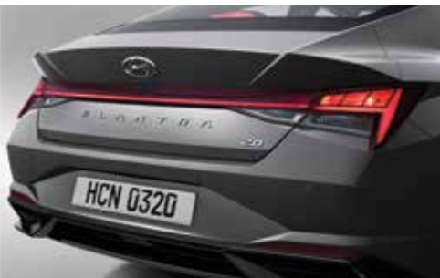
LED + Bulb Rear Combination Lamp