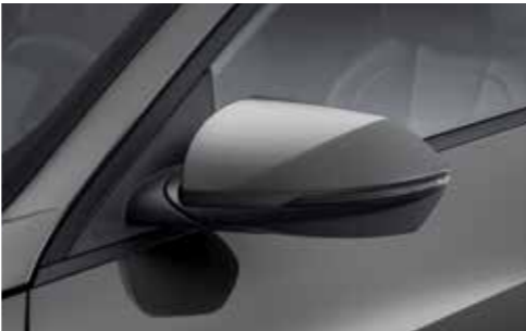
Exterior Sideview Mirrors (heated, power folding, LED turn signal indicators)