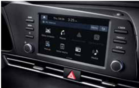
8" Display Audio System