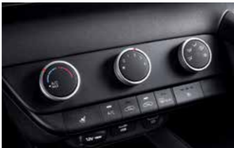
Manual Air Conditioner