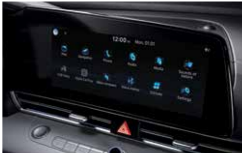
10.25" Navigation Display