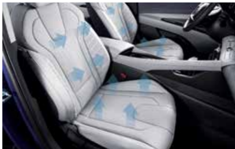
Ventilated Front Seats