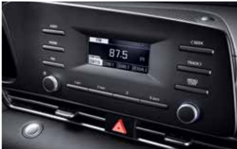
Basic Audio System