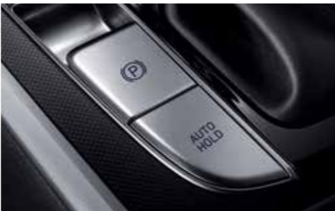
Electronic Parking Brake