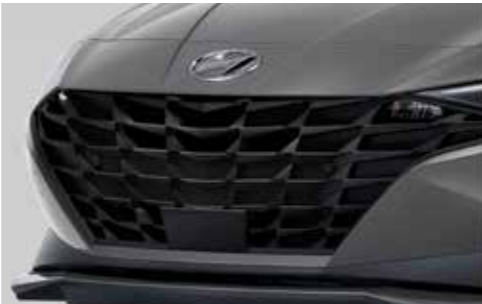
Black Radiator Grille