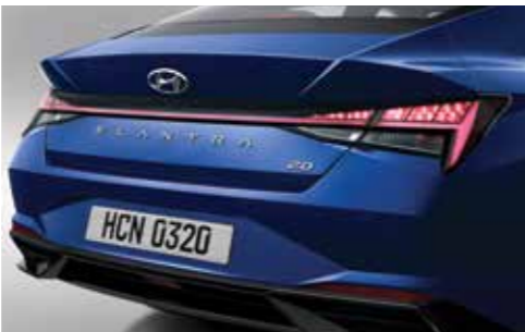
LED Rear Combination Lamp