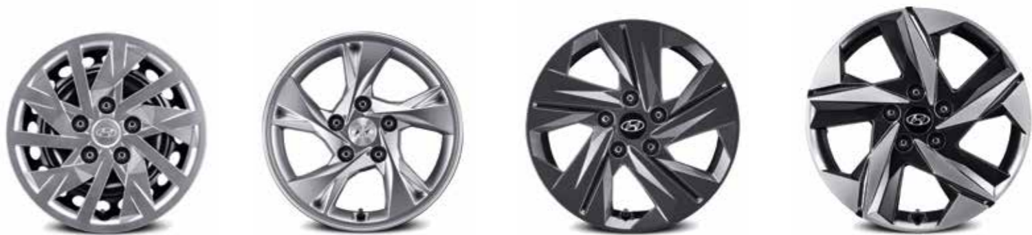
15" Steel Wheel & Wheel Cover