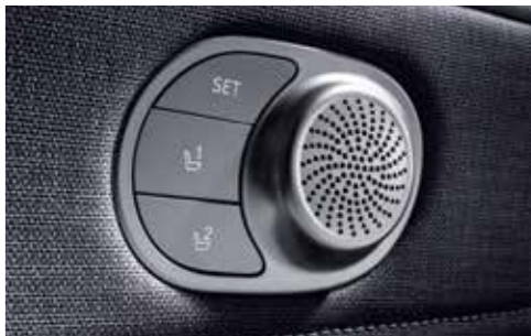
Memory System For Driver's Seat