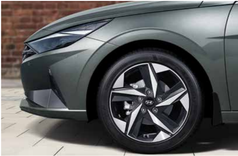
LED Headlights 17" Alloy Wheels & Tires