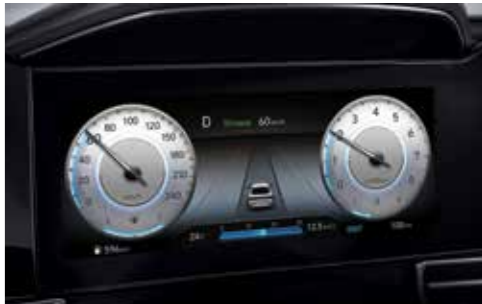
10.25" Full Color Cluster Display