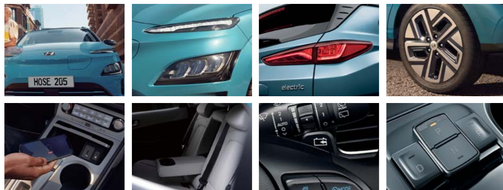
Flowing aerodynamic design Wireless charging pad Twin headlight design Heated rear seats LED rear combination lamps Paddle shifter (Regenerative braking control) 17" alloy wheel Electronic gear shift button