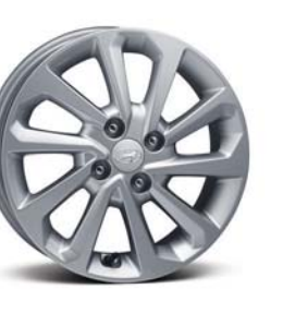
15" alloy wheels