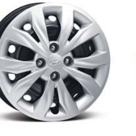
15" wheel covers