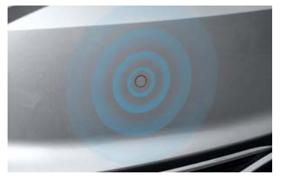
Rear parking assist system