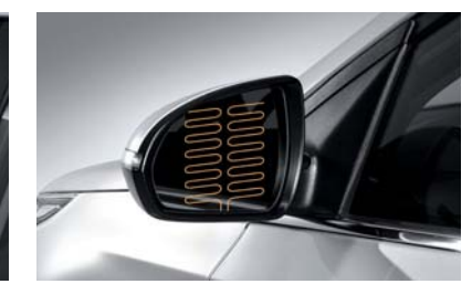
Heated side mirrors