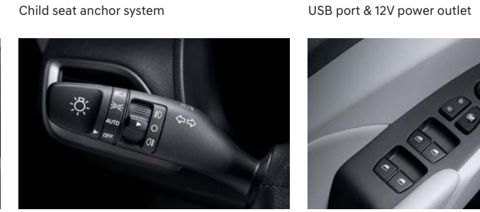
One-touch triple turn signal