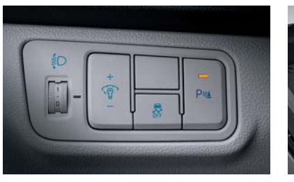
Rheostat & Electronic Stability Control