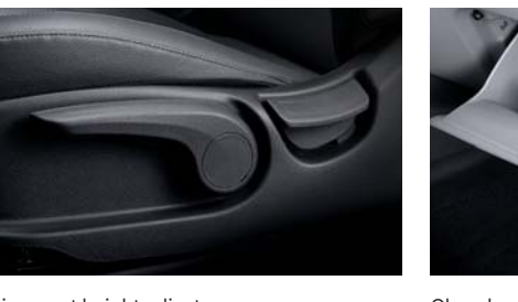
Driver seat height adjuster