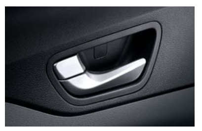
Metal inside door handle