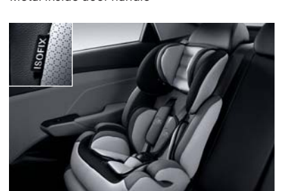
Child seat anchor system