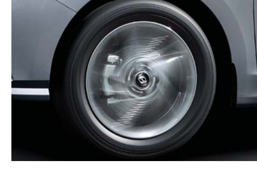
Front disc brakes

For drivers who put economy above all else, the 6-speed manual is the perfect choice. Clutch operation is easy and predictable and as you shift through the gates, there's a nice, precise feel.