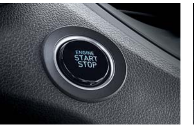
Push-button start / Smart key