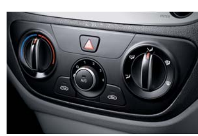
Manual air conditioning system