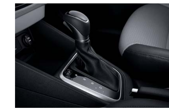
6-speed automatic transmission

You will hardly notice this 6-speed gearbox doing its work. Automatic shifting is quick, smooth and quiet but also very convenient. Its efficient design helps maximize fuel economy.